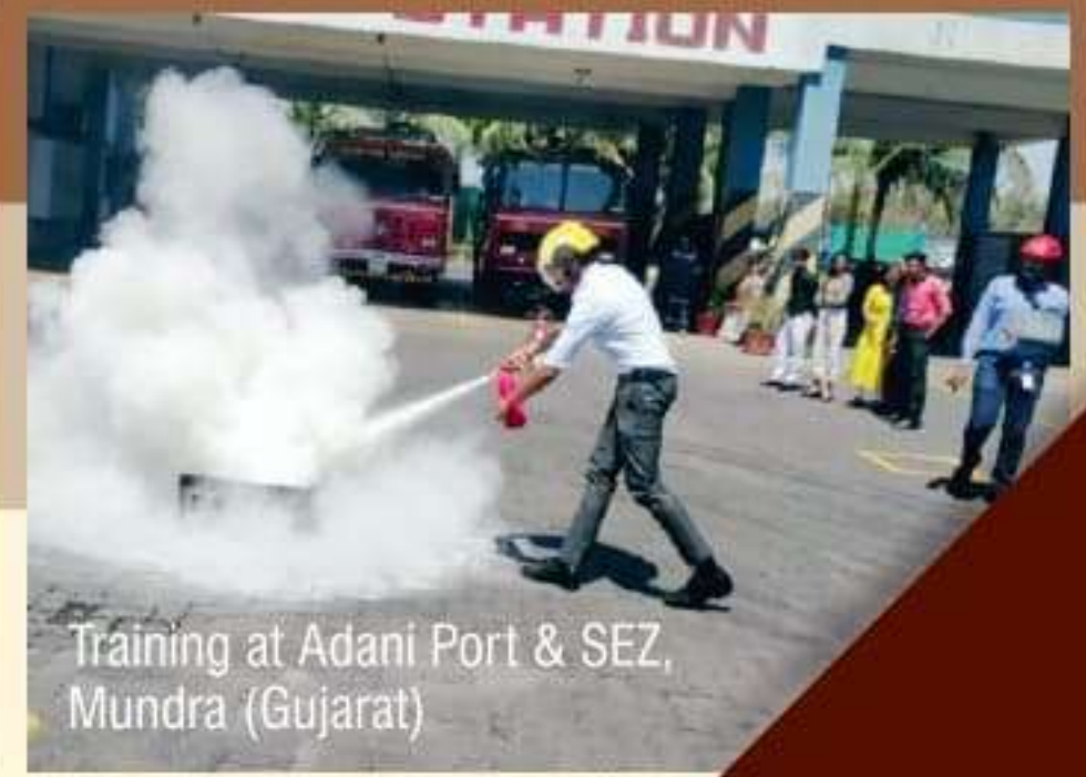
Training at Adani Port & SEZ, Mundra (Gujarat)