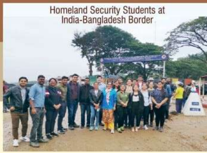
Homeland Security Students at India-Bangladesh Border