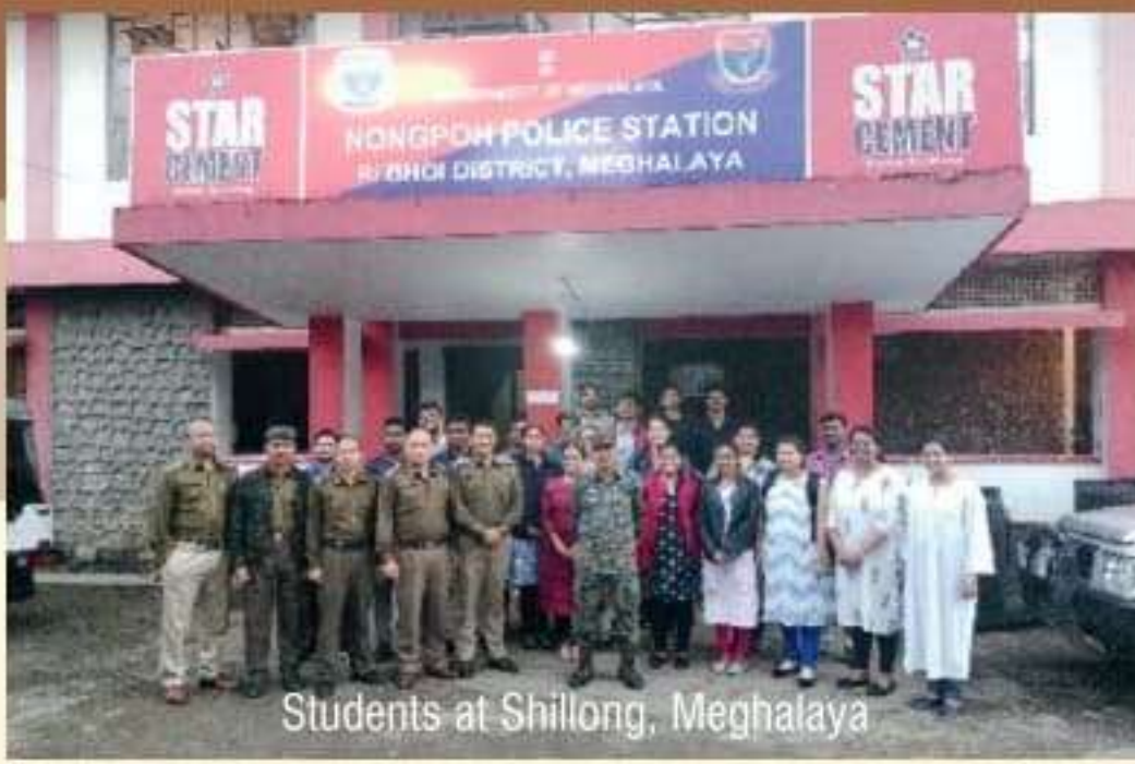
Students at Shillong, Meghalaya