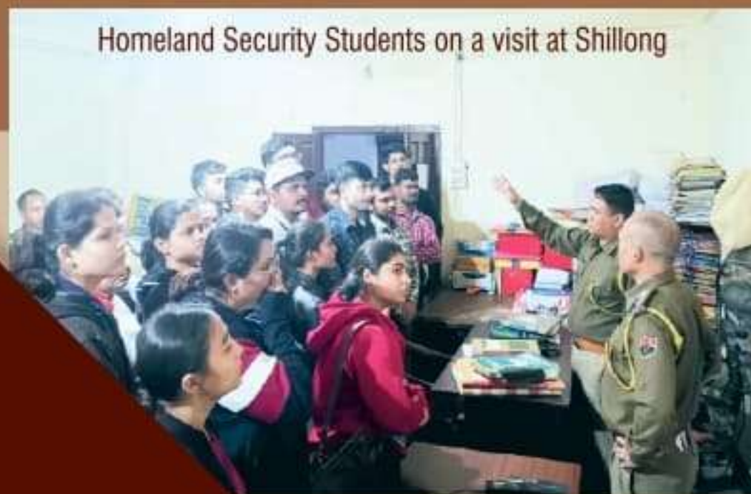
Homeland Security Students on a visit at Shillong