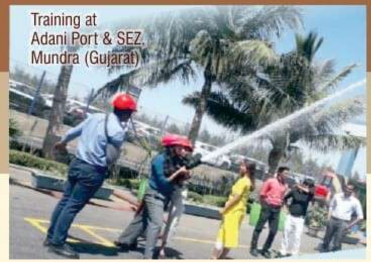
Training at Adani Port & SEZ, Mundra (Gujarat)